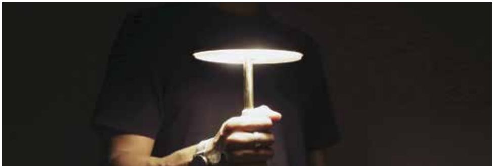
Wireless lamp by Georgina Heighton