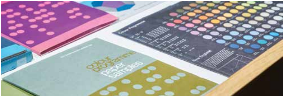
Art on Paper.