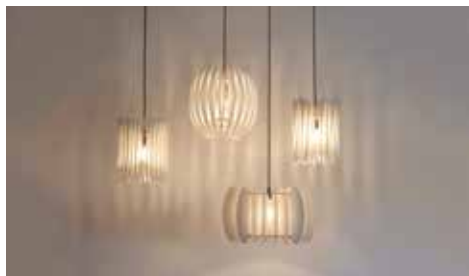
North Sea Collaborations