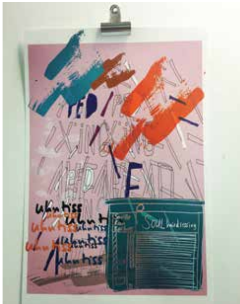
Newcastle College student work